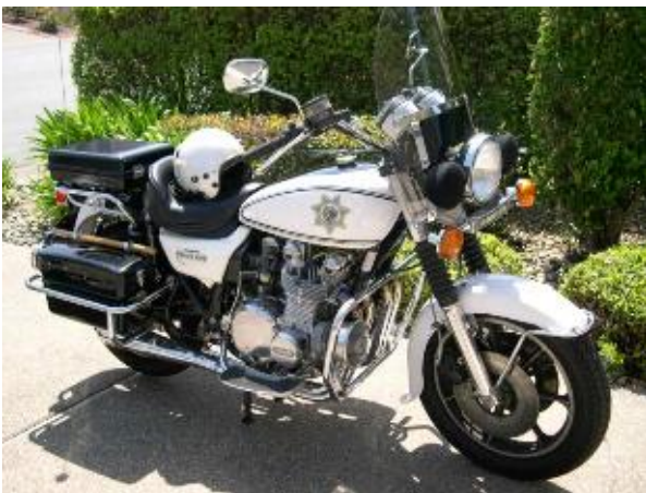
(One of two used by TV Show CHiPs) Gift of Art Pauly