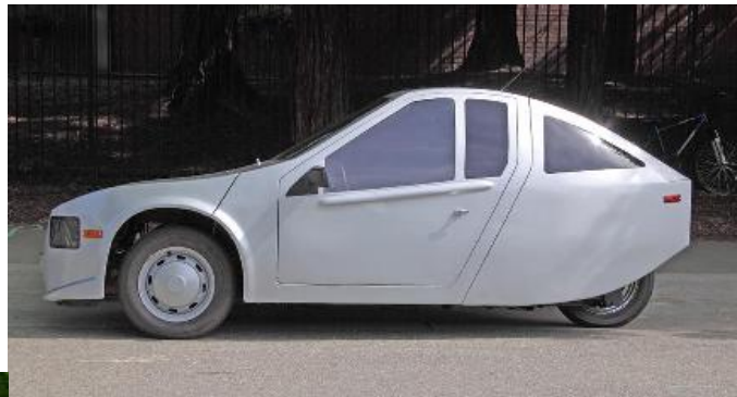
“The Quiet One” Electric Vehicle Gift of Nels Overgaard