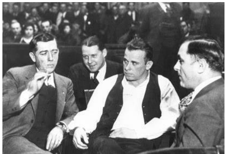
Bank robber John Dillinger in court in Crown Point, Indiana in 1934.

Not everyone believes celebrating the escape vehicle is a good thing. Love and Pace, who got to know each other after Pace purchased a 1933 Essex Terraplane from a Dillinger Museum, acknowledge the obvious negativity surrounding a murderous criminal who was once regarded as Public Enemy No. 1, but they're hoping some good can come from it.