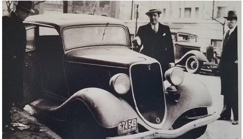
Police surround the 1933 Ford V-8 that John Dillinger used as an escape vehicle and left running on a Chicago street.