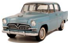
1959 Toyopet Crown

Toyota’s Accomplishments in Environment, Racing and Reliable Cars are showcased