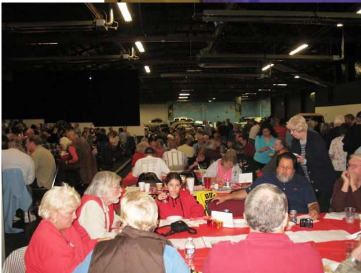
Car Club Tree Trim