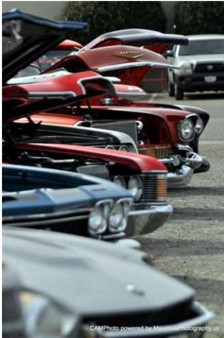
← American Muscle Grand Opening Car Show