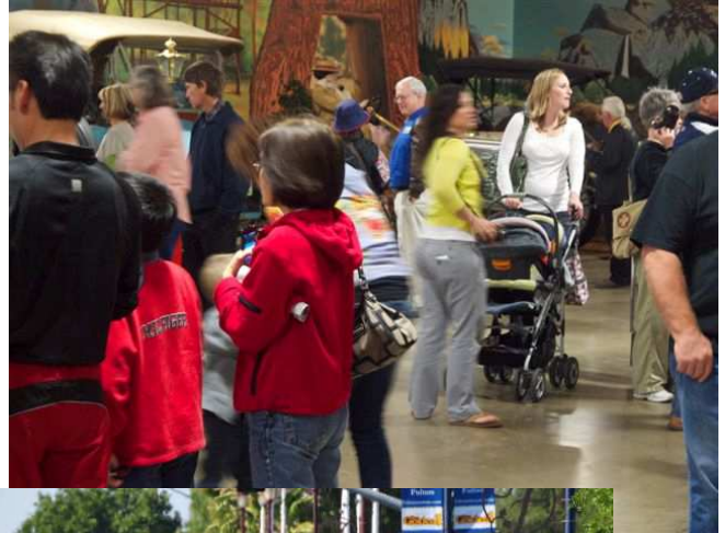
Free Museum → Day