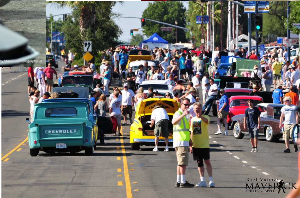
CAM Cruise →