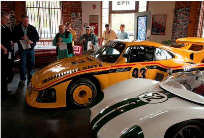
Day Trip to Academy of Art Institute