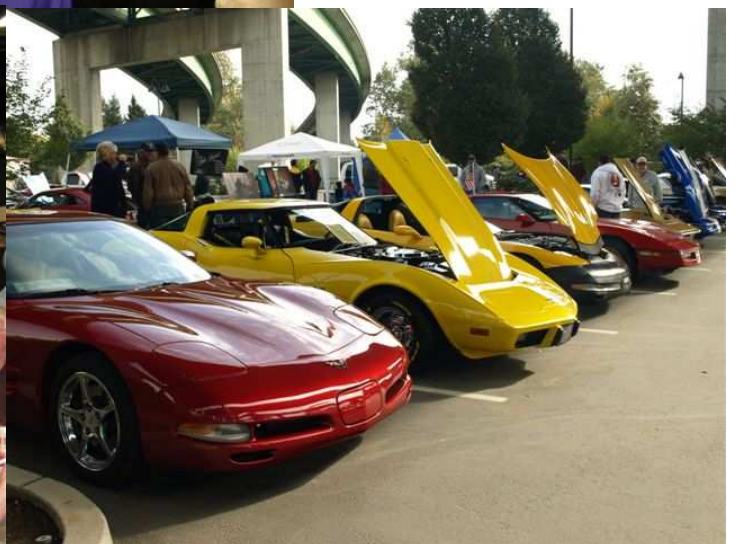
Vettes for Vets