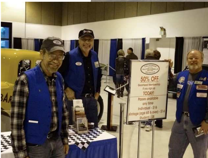
International Auto Show