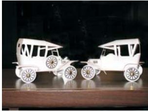
Paper Model Ts

This tour is designed to allow students the opportunity to experience what it was like to work on one of Henry Ford's famous assembly lines. Students will learn about Henry Ford, the assembly line, and the importance of the Model T in automotive history by touring the Museum exhibits. Also included in this tour is a hands-on activity where students will create their own assembly line and build paper Model Ts, which they get to take home as a memento of their visit to the California Automobile Museum. Please note, this tour is not yet aligned with the California Curriculum Standards and Frameworks.